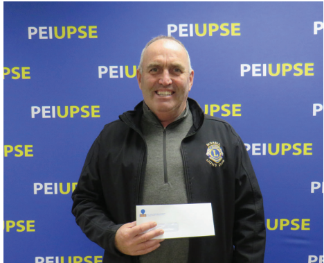
Morell Lions Club, $600