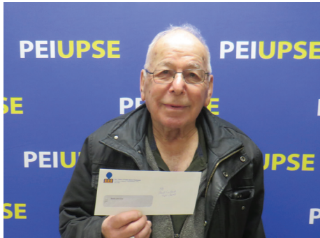
Souris Lions Club, $600